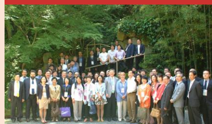
The 5th meeting of ISO/TC249/WG4 Kyoto, Japan on May 28, 2014