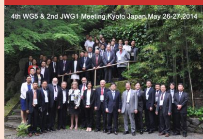
4th WG5 & 2nd JWG1 Meeting, Kyoto Japan, May 26-27, 2014